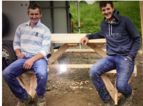
Llanbadarn Fynydd YFC