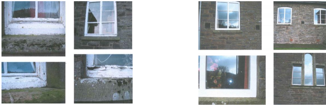
Bettws y Crwyn Parish Hall