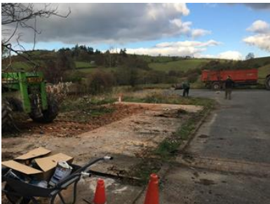
Llanbister Community Hall