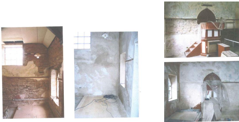
Black Mountain Chapel