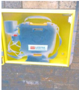
Llanbister Community Council